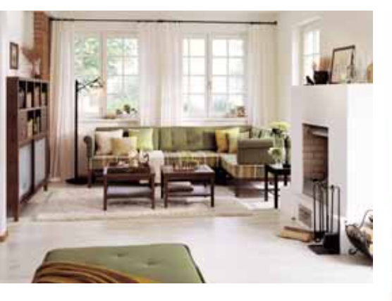
Original and natural, elegance and elaborate style – this is how the "Hit-Villa" life feeling can be characterised. With its artlessness and style of the aristocratic village life it challenges our desire to search for such values, roots and things which tell us historical stories.