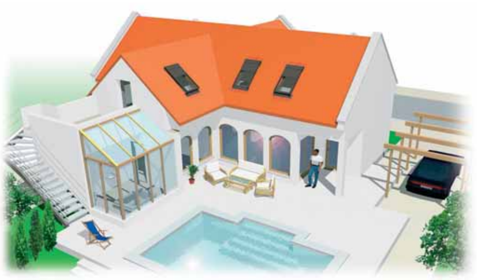
"Hít-Vílla". Pannonían and famílíar.